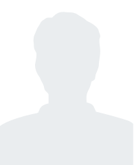
Vacant x 2