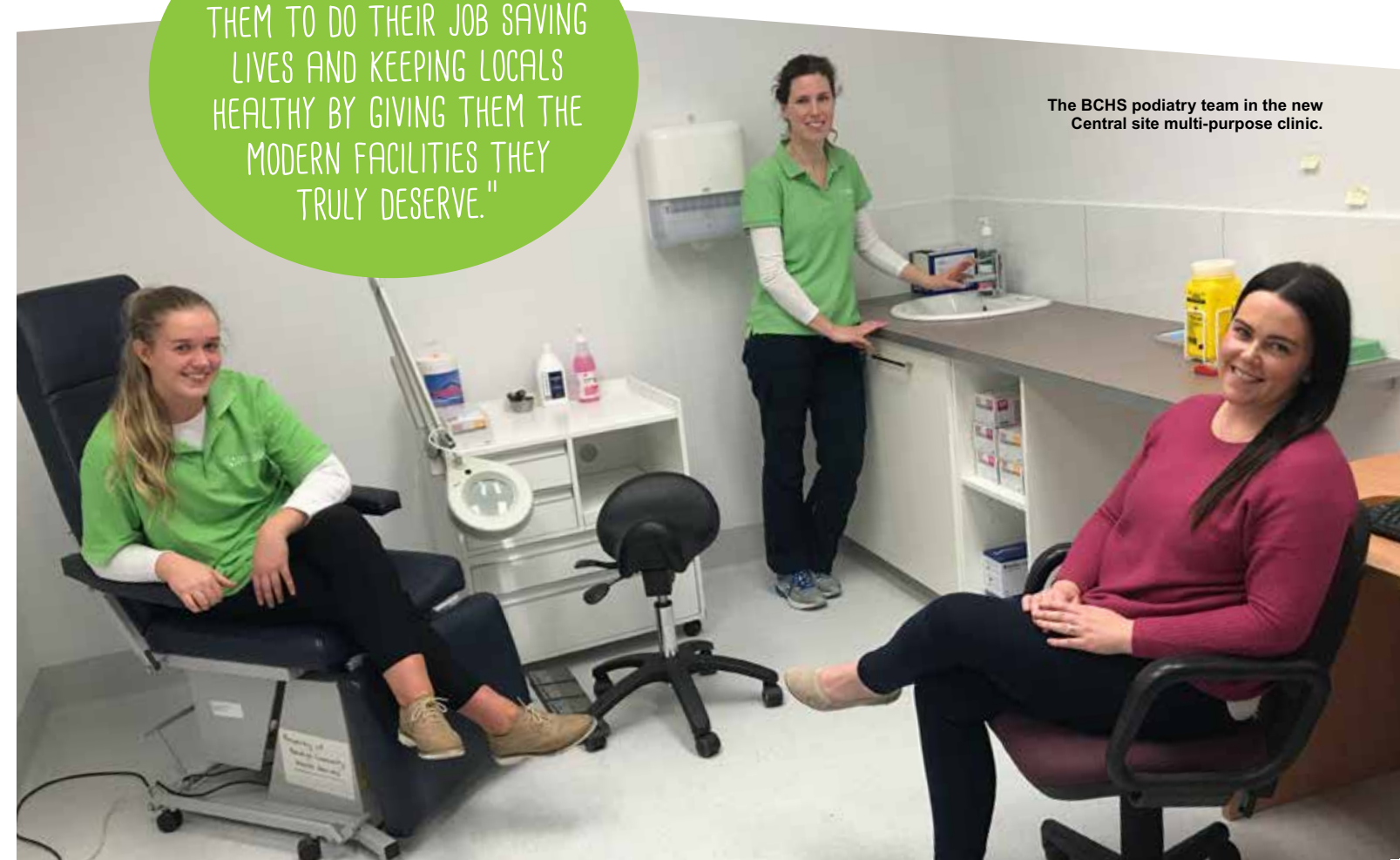
The BCHS podiatry team in the new Central site multi-purpose clinic.

"WE ARE SUPPORTING THEM TO DO THEIR JOB SAVING LIVES AND KEEPING LOCALS HEALTHY BY GIVING THEM THE MODERN FACILITIES THEY TRULY DESERVE."