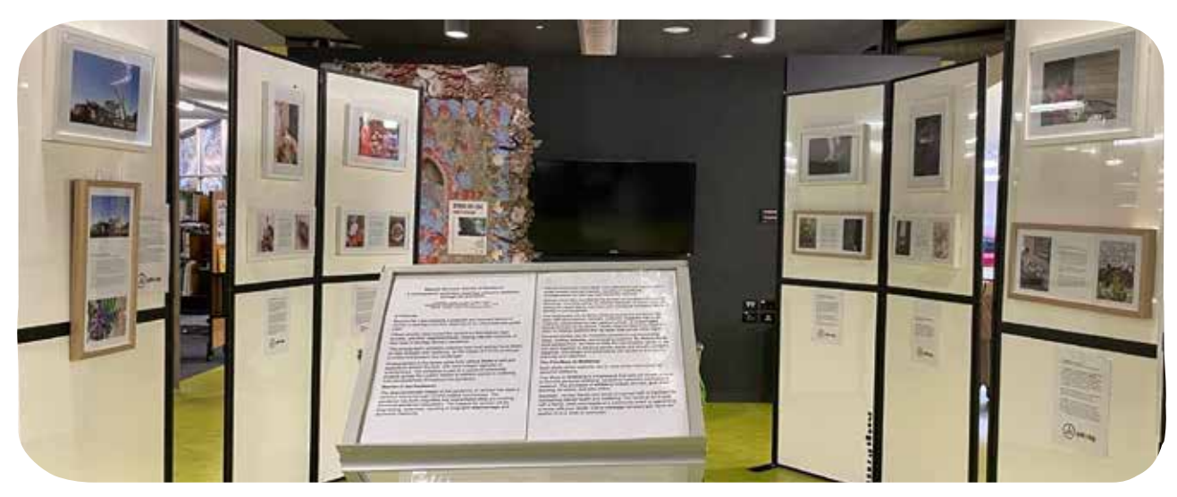
5 WAYS TO WELLBEING: The exhibition encouraged women to focus on the five principles for wellbeing.

Give – Giving to others can have an overwhelmingly positive effect on your personal wellbeing. You do not have to spend money to give. Generosity can be as simple as taking the time to check in with a friend or offering your seat to someone on public transport. If you take some time to practice empathy and identify ways you can improve the lives of those around you, everyone will reap the benefits. If you have spare time you can volunteer in your community. Try contacting a local organisation that you support and see if your skills can be utilised there. This might be a local support service, your local community radio station, an opportunity shop.