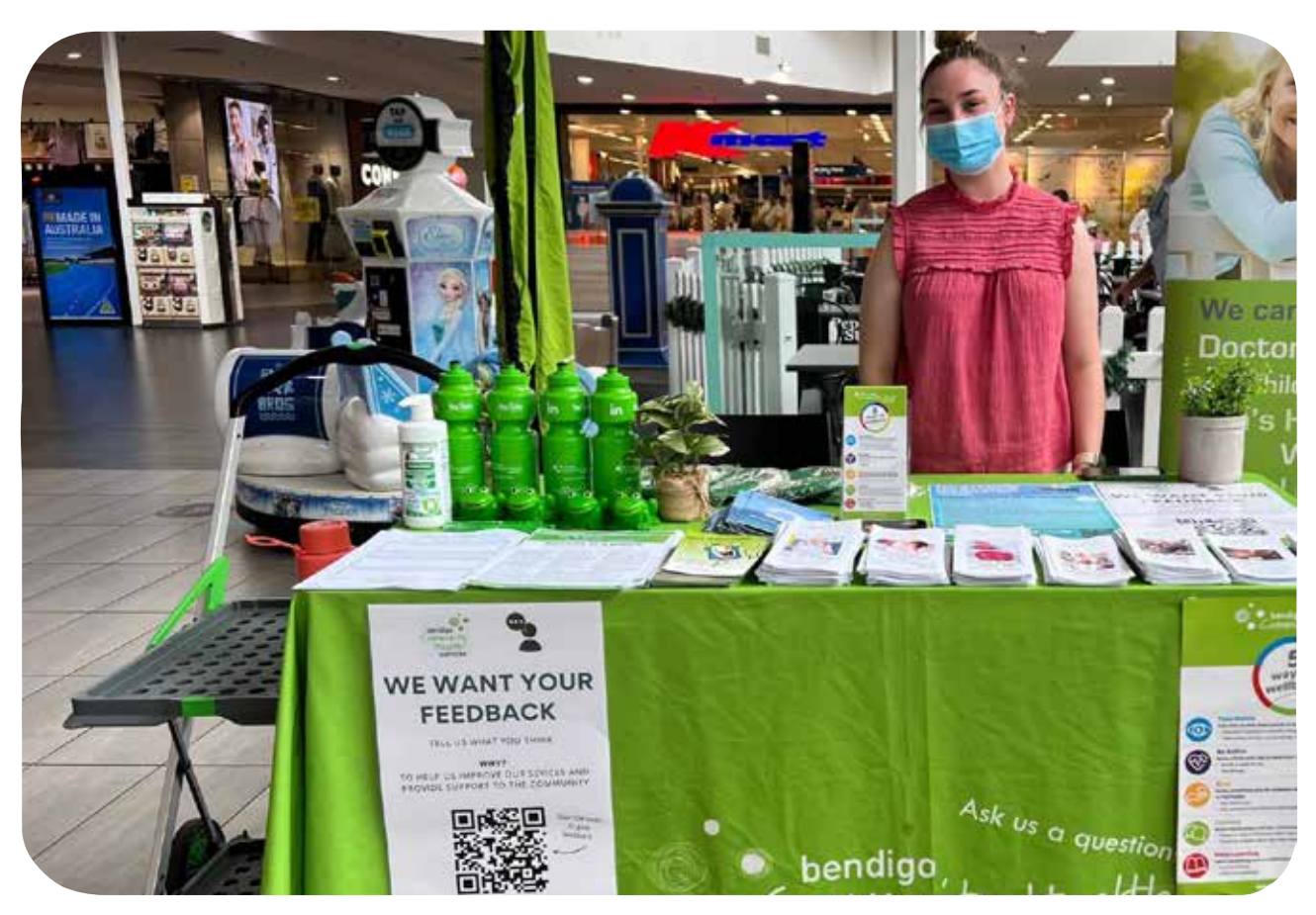
HEALTH PROMOTION: Our team is passionate about improving health and wellbeing in the community.