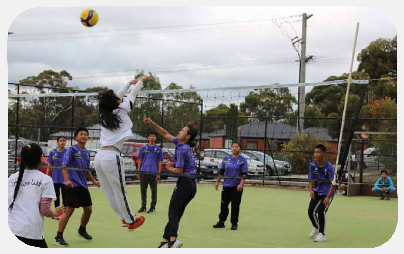
BRINGING PEOPLE TOGETHER: More than 200 young people participated in the volleyball competition.

Help apply for the $200 sporting participation voucher for those families who are eligible