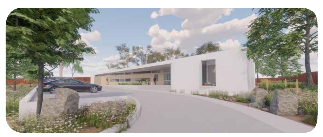
WELLNESS CENTRE: A design image courtesy of EBD Architects.