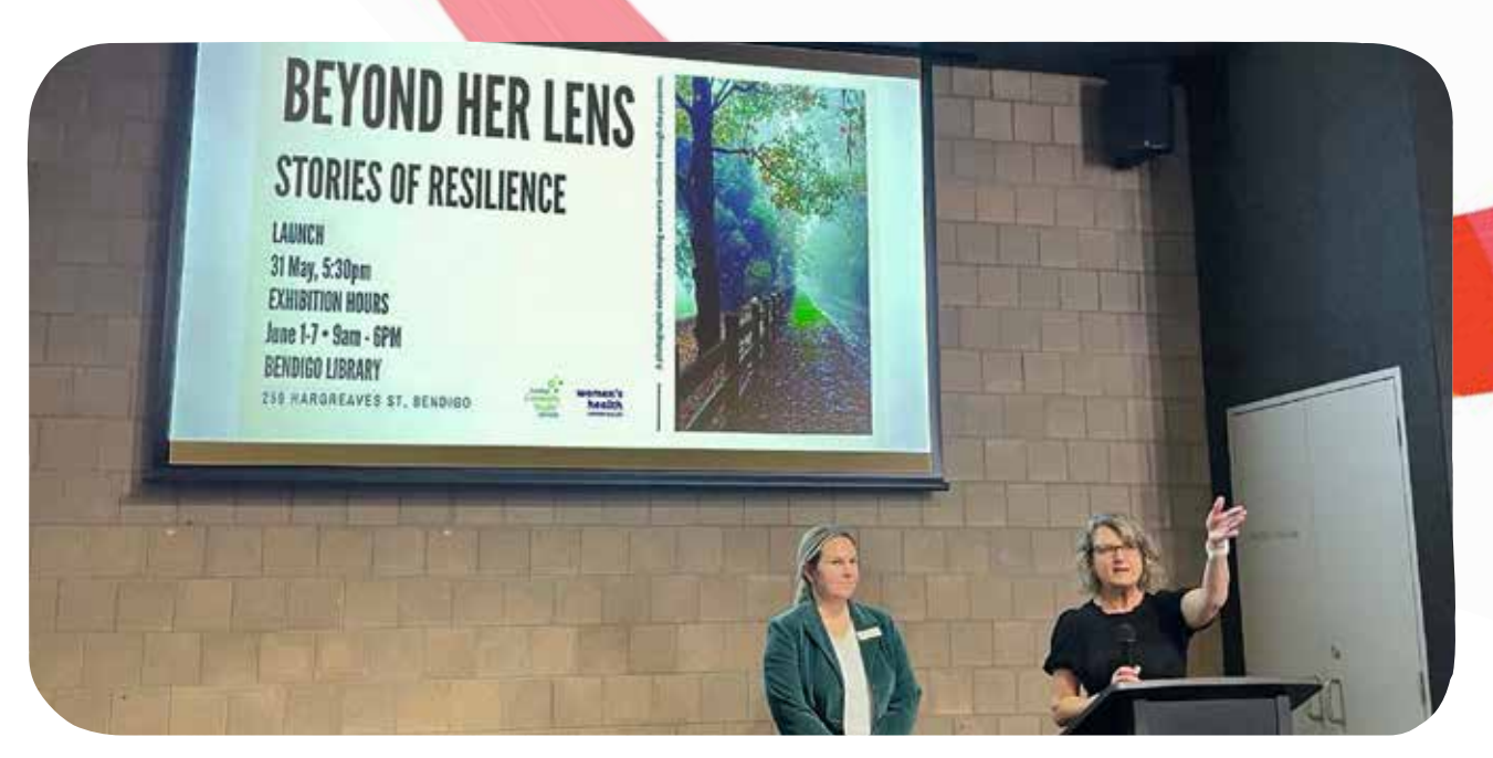
WOMEN'S RESILIENCE: Beyond Her Lens captured how women have drawn on their strengths during the pandemic.