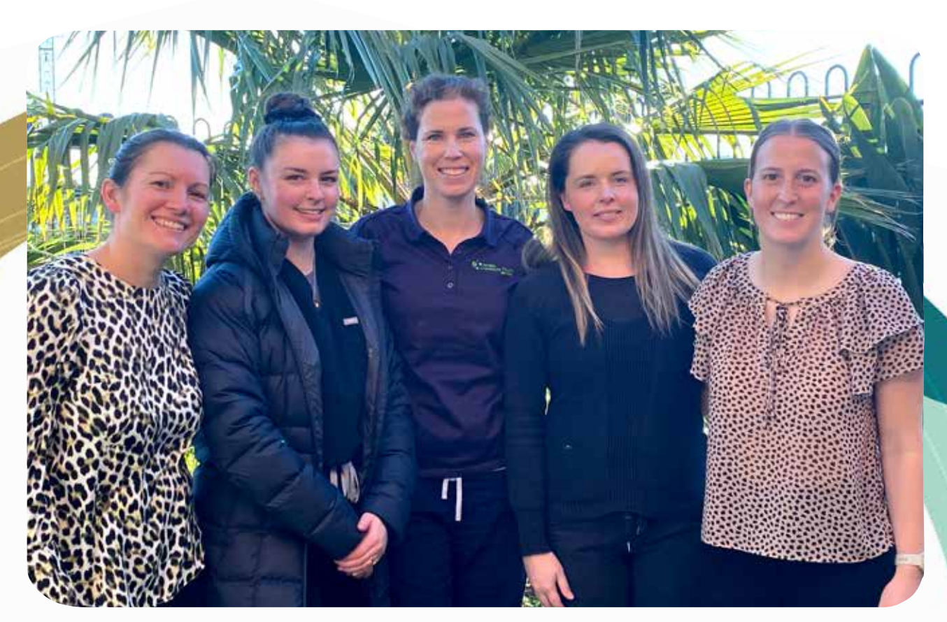
FOCUSED ON CLIENT CARE: Our Podiatry team is always seeking ways to improve our services.

"The cultural safety training component and the cultural tour on country were highlights and gave me ideas of ways we can make our service more appealing and culturally safe for aboriginal people," she said.