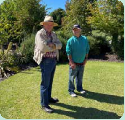
FRIENDSHIP: The Elmore Social Support Group brings people together.